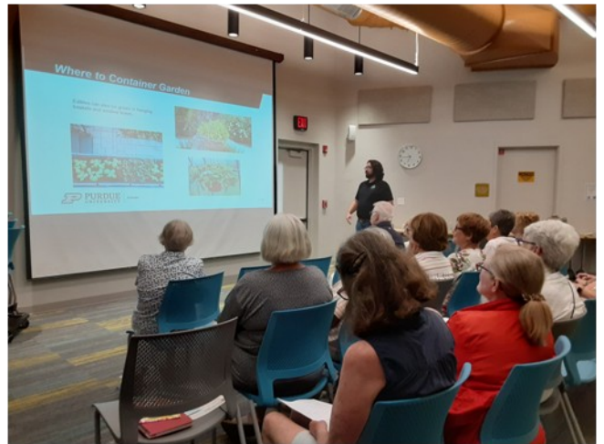
Public was invited to program on container gardening