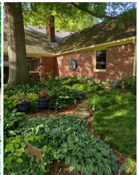
Hosta garden tour