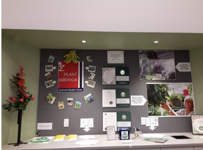
National Garden Week display at Lawrence Library