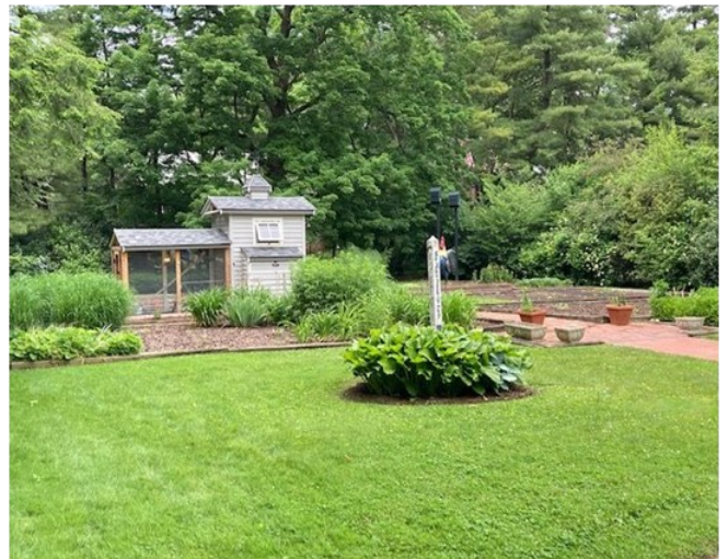
Overview of garden at Governor's residence with chicken coop